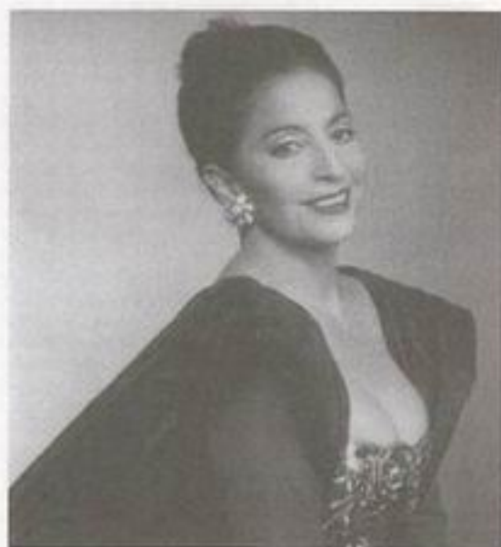
Teresa Berganza (Voice)